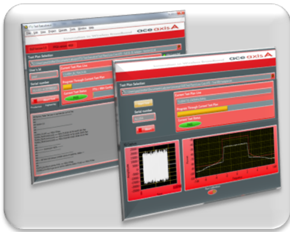
Example Test Executive